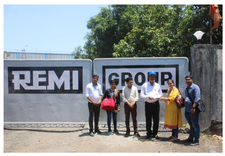
Teachers handing over an appreciation letter to employees at Remi Group